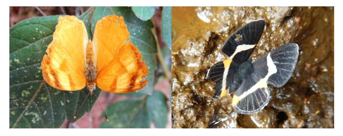
3rd Day 11November Waldenor Trail

Woodcreeper, Golden-crowned Warbler and a beautiful Crescent-chested Puffbird were new. We also found White-winged Becard , Atlantic Forest endemic Ruby-crowned Tanager , Bananaquit and Brazilian endemic White-collared Foliage-gleaner . We had mixed luck with the endemics here since we heard 3 really good species, Serra Antwren , Southern Antpipit and Suruca Trogon , but not managed to see them. Still altogether we had a marvellous day with visiting several different areas, beautiful landscapes and saw a long list of birds and other wildlife.