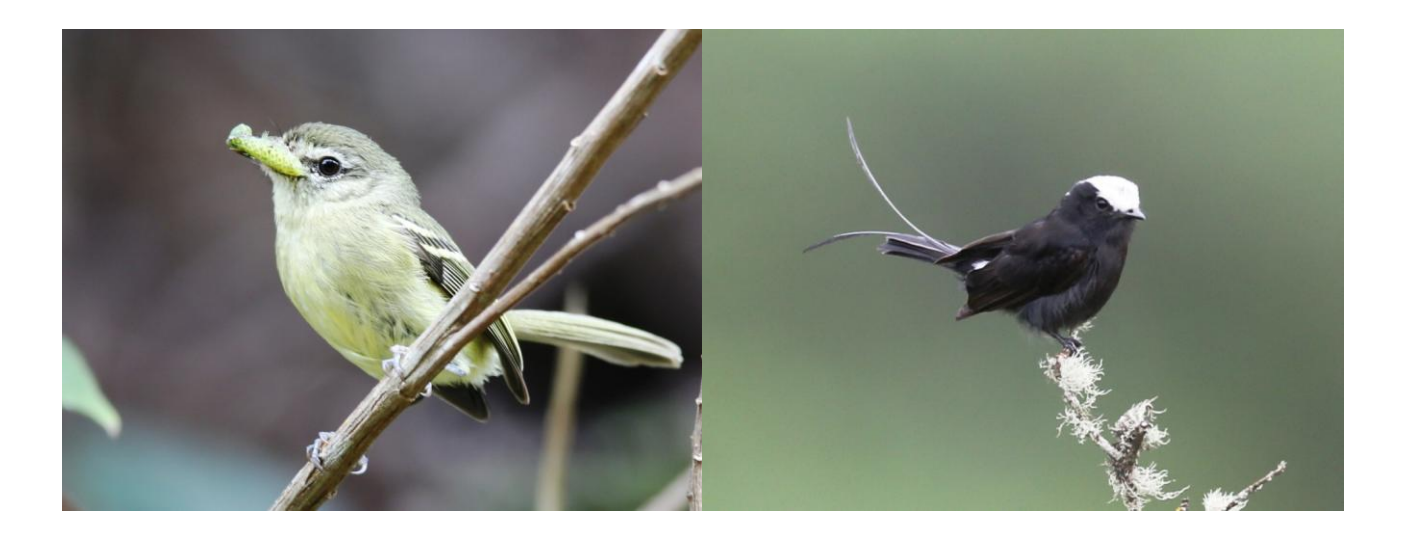
5th Day 13November Morning 4x4 trail; afternoon Maroon Trail