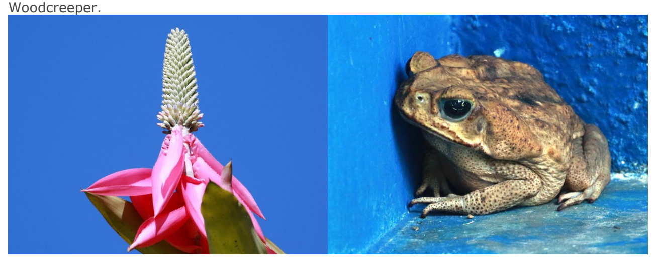
Day12 2March 2020

Finally we tore ourselves away from the feeder area and visited a short trail to the river. We had a singing Buff-rumped Warbler, a pair of Bay Wrens and on the other side of the river an Amazon Kingfisher. We continued our circle on the trails, but it became quite silent, although we heard Red-lored Parrots and Brightt-rumped Attila. We also had a Streak-headed