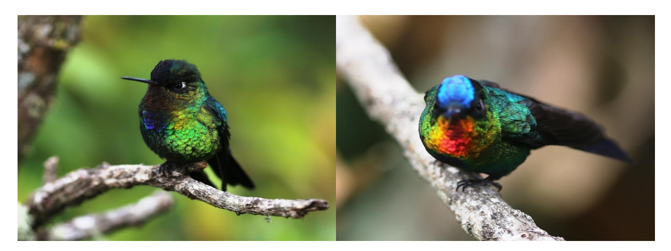
Day13 3March 2020

Rufous-winged Woodpecker. We all had a great view of this bird as well. Surprises were still not over since Gabor pointed out a Black-faced Grosbeak which was not very well visible, so he called it out. We also heard a White-collared Manakin calling and displaying, dashed through once, but nobody had a good view of it in the very dense vegetation. Still it was a very nice walk with great activity and some lovely new species.