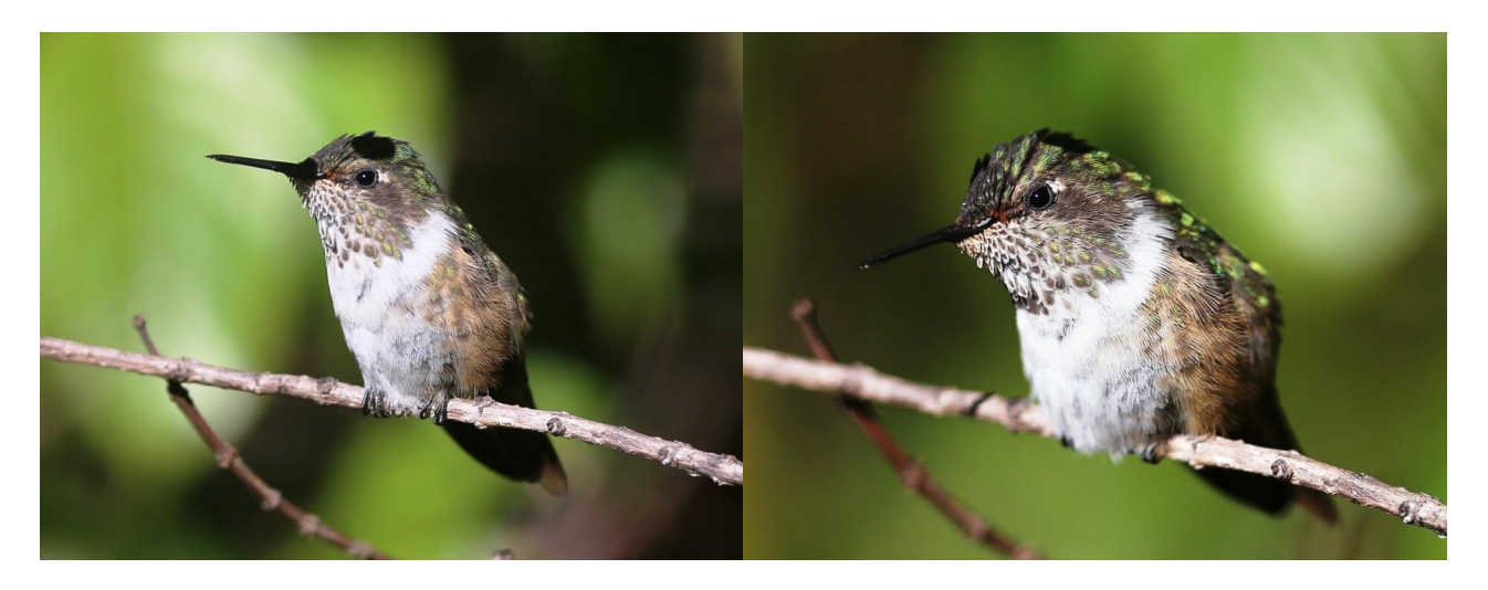
Simon made a photo of a black and yellow bird from below, a bit of a cloaca view which was identified first as Black-and-gold Tanager, but later re-identified as Black-thighed Groesbeak.