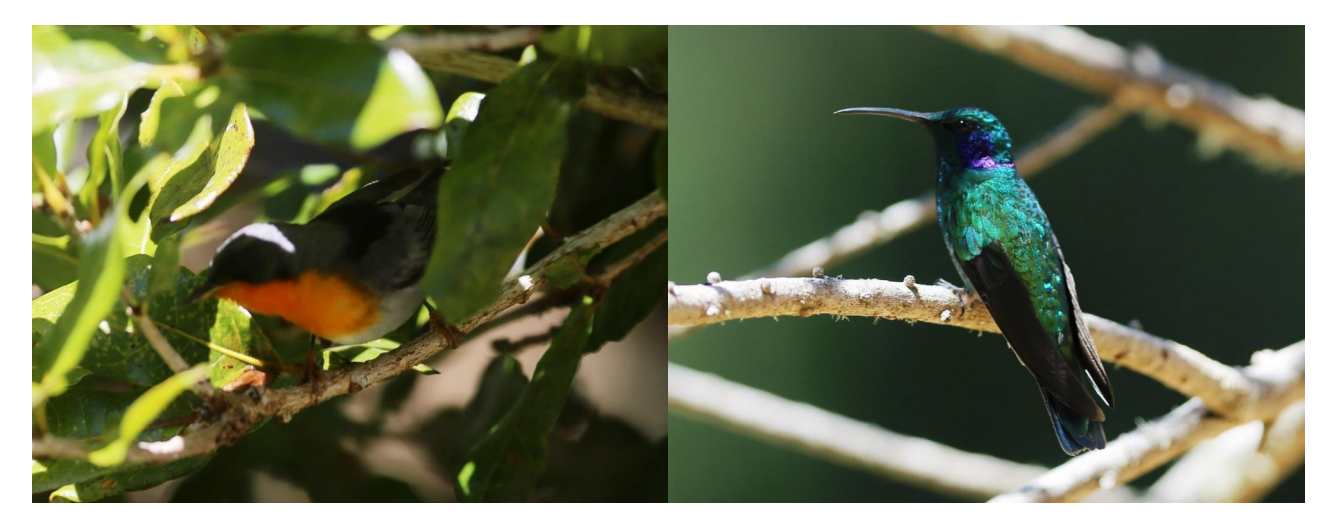
Finally we went back to our favorite coffee to spend 2 hours more with watching birds there and also at another place nearby. Both offered pretty good photo opportunities as well while we enjoyed fresh fruit juices. We found some new species as well such as the amazing Fiery-throated Hummingbird and Green-fronted Lancebill.