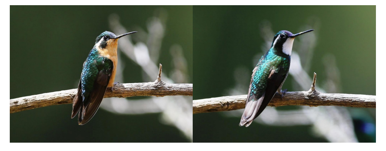
After another tasty lunch we started our journey to the Sarapiqui region. We got the news that unfortunately the road we wanted to use was closed so we had to do a much longer detour in smaller roads. In his way the journey instead of 4-4,5 hours took close to 6 hours.